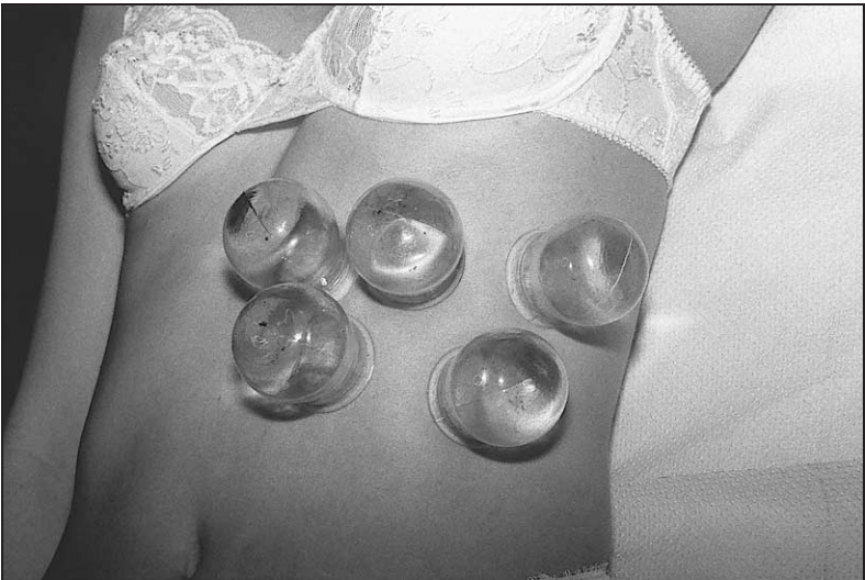
Fig. 10.4 Dry cupping on the upper abdomen on the left side.