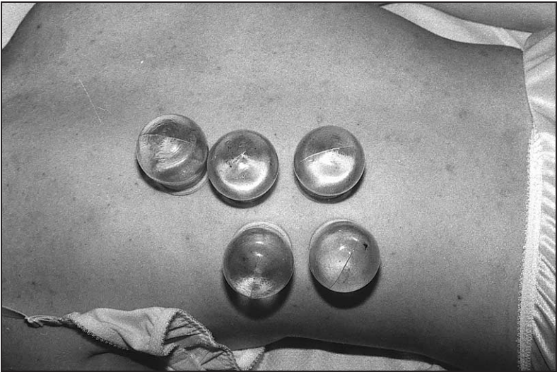
Fig. 10.3 Dry cupping on the back in segments T2–L1, especially in the areas of tender points.